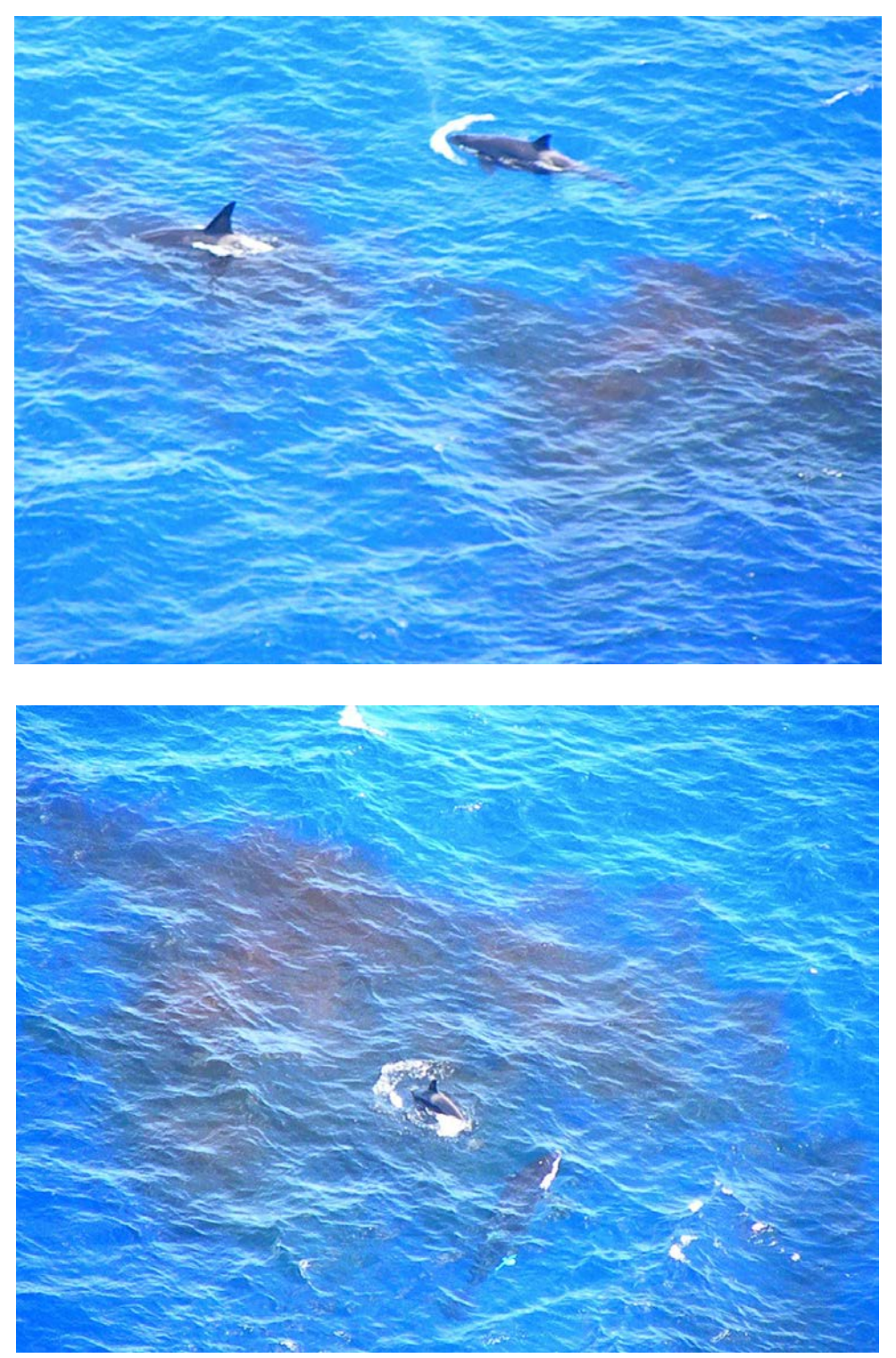
Figure 8. Two views of killer whales 20 miles south of FDM on 25 May 2010