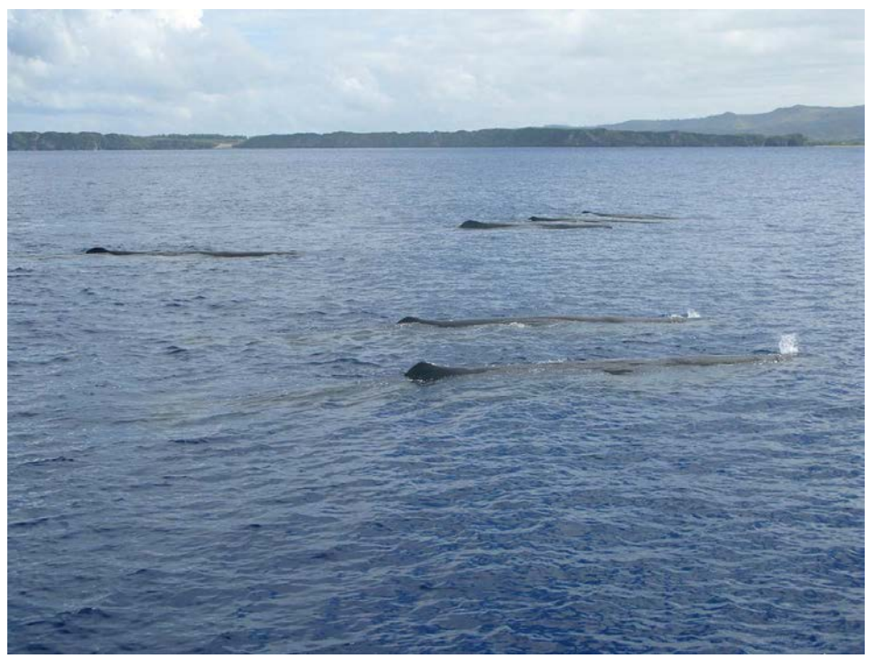
Figure 10. Sperm whales sighted 20 February 2010

The Andersen Air Force Base (AAFB) Marine Patrol Volunteer Program (MPVP) regularly surveys the shoreline at AAFB, and reported that they frequently sight spinner dolphins and whales along the Tarague Basin perimeter ocean frontage, and also regularly sight spinner dolphins at Tumon Bay on both sides (i.e., near Hilton Guam Resort, as well as near Gun Beach), Piti Channel Hap Reef, Agat Bay, and Cetti Bay (Felix Reyes [Guam Visitors Bureau], pers. comm., 25 June 2013). The point of contact for the AAFB MPVP, Felix Reyes, also provided the author with photographs of whales sighted offshore of the Agat Bay and Umatac Area on 20 February 2010 (Felix Reyes, pers. comm., 11 June 2014 and 25 June 2013). Upon examination by NAVFAC EV24, these were identified as sperm whales. At least six animals were visible in one photograph (Figure 10), and that number was used as the group size. Following other nearshore sightings in the DAWR set (see below Section 3.8) that were referenced to terrestrial landmarks, the location of the sighting was estimated to be 500m offshore of the reef margin. The time of day was transcribed from the photograph file metadata.