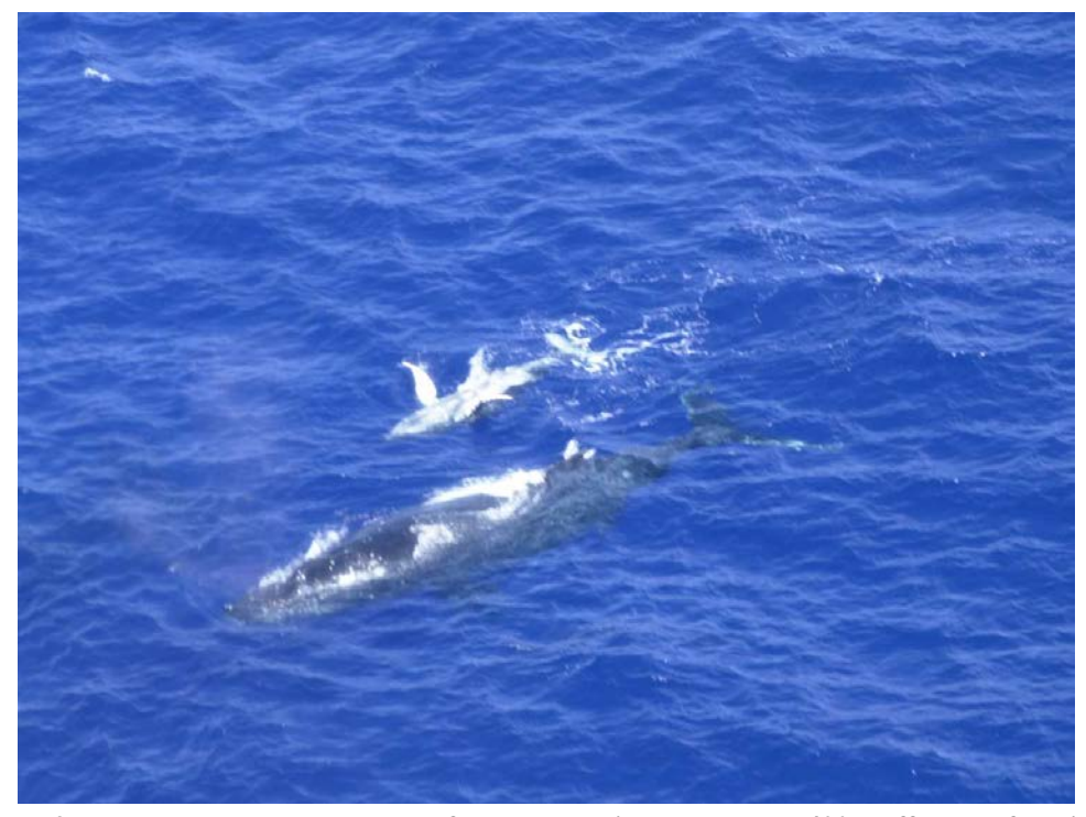
Figure 3. Humpback whale mother-calf-escort pod sighted at FDM 400m offshore of station 1 on 24 March 2003

Only mother and calf visible in photo.