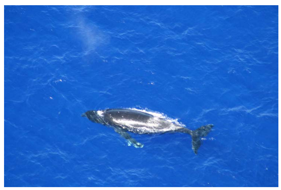
Figure 4. Humpback whale sighted at FDM on February 18, 2007