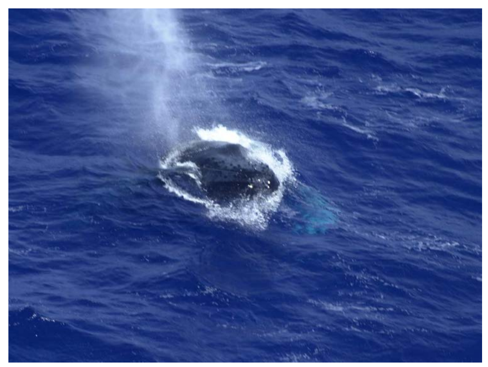
Figure 2. Humpback whale sighted ¼ mi offshore at FDM on 26 February 2001