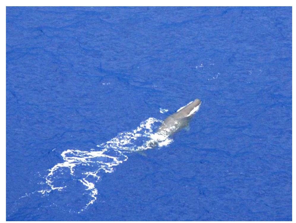
Figure 9. Sperm whale sighted 20 September 2011 sighted during aerial transit between Saipan and Farallon de Medinilla