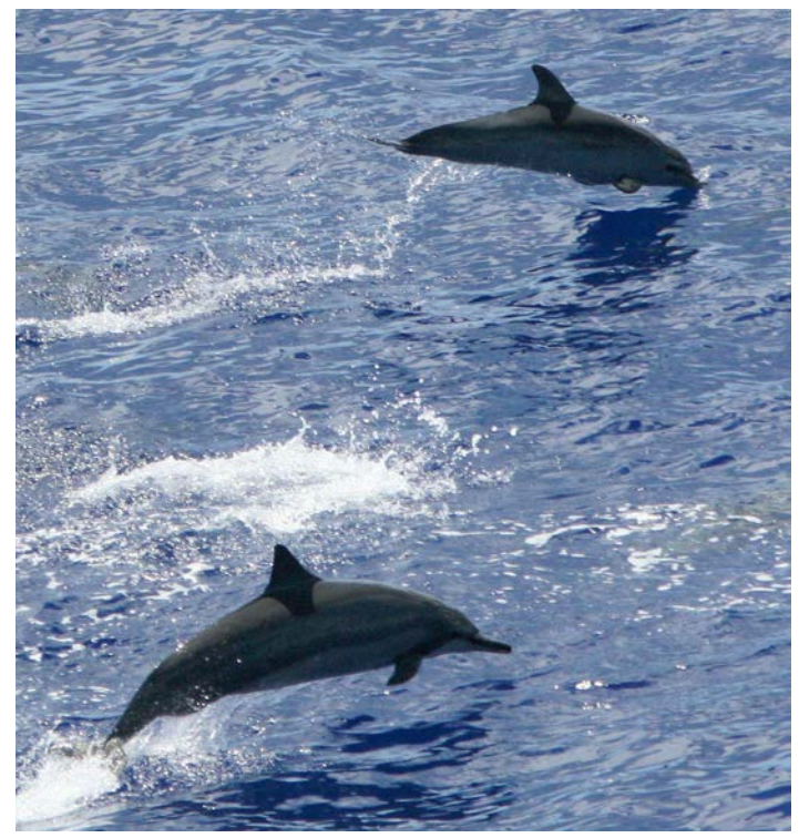
Figure 5. Mixed-species pod 50km north of Saipan in transit to FDM on 28 July 2007 Top: pantropical spotted dolphin. Bottom: spinner dolphin.