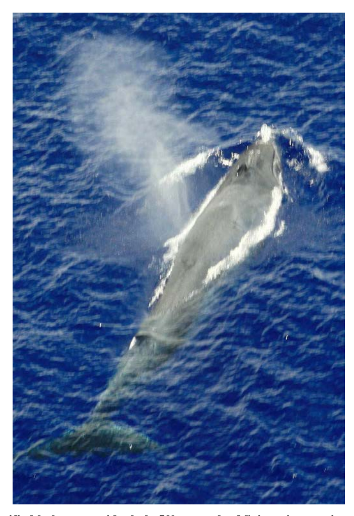
Figure 7. Unidentified balaenopterid whale 50km north of Saipan in transit to on 28 July 2007 Photo credit: Scott Vogt and Anne Brooke (U.S. Navy).

Photo credit: Scott Vogt and Anne Brooke (U.S. Navy).