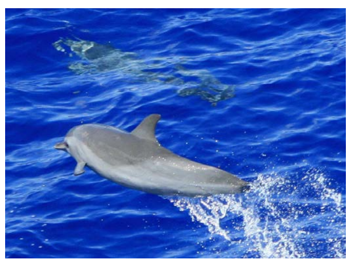
Figure 6. Pan-tropical spotted dolphin from mixed-species pod 50km north of Saipan in transit to FDM on 28 July 2007