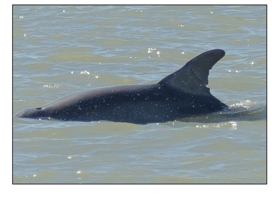
Tursiops truncatus , about 380 m from the camera, 11 January 2012