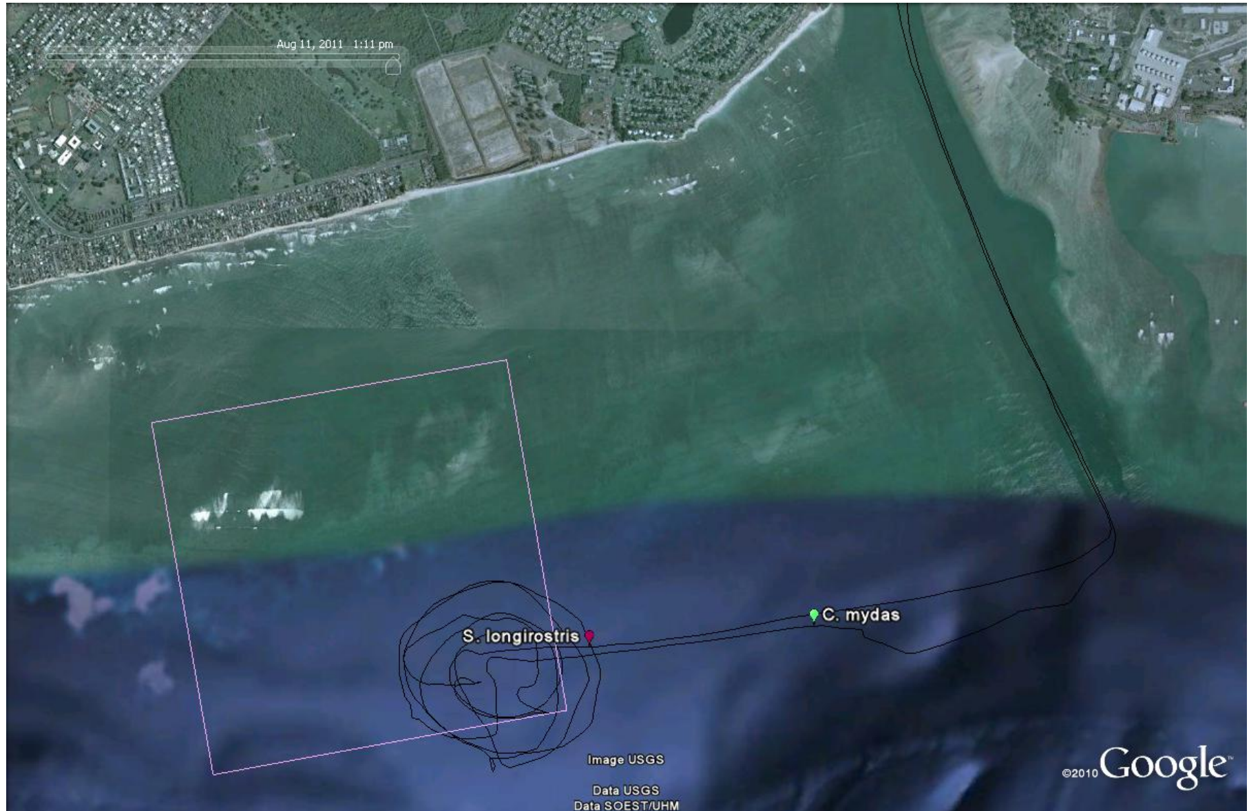
Figure 6. Locations of sightings during UNDET monitoring of 11 August 2011. The boundaries of the Pu'uloa Underwater range are marked by the pink square. Marine species monitoring vessel track shown in black. The entrance to Pearl Harbor is at top right.