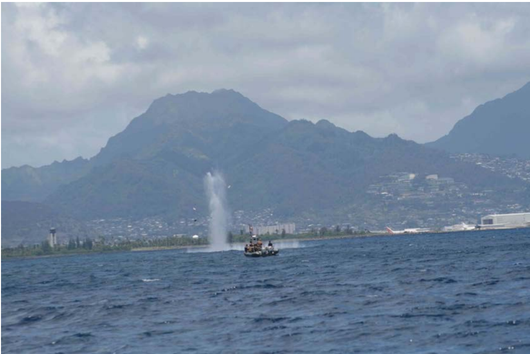
Figure 4. Event one of 10 August 2011: 19.99 lb. NEW