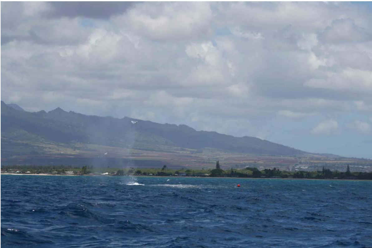
Figure 7. Event one of 11 August 2011: 19.99 lb NEW