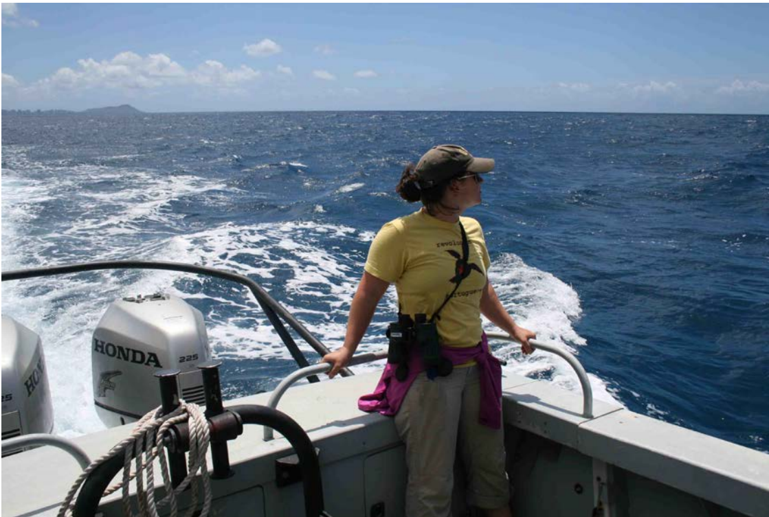
Figure 1. Navy marine species observer on the monitoring vessel, a Boston Whaler.