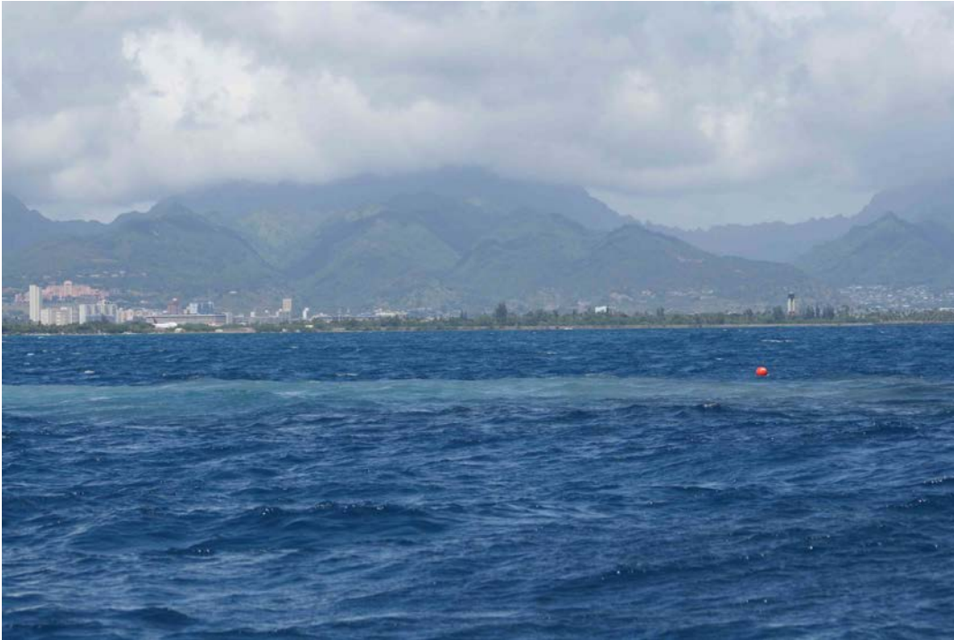
Figure 5. Plume of sediment and gas after 10 August 2011 UNDET number two.