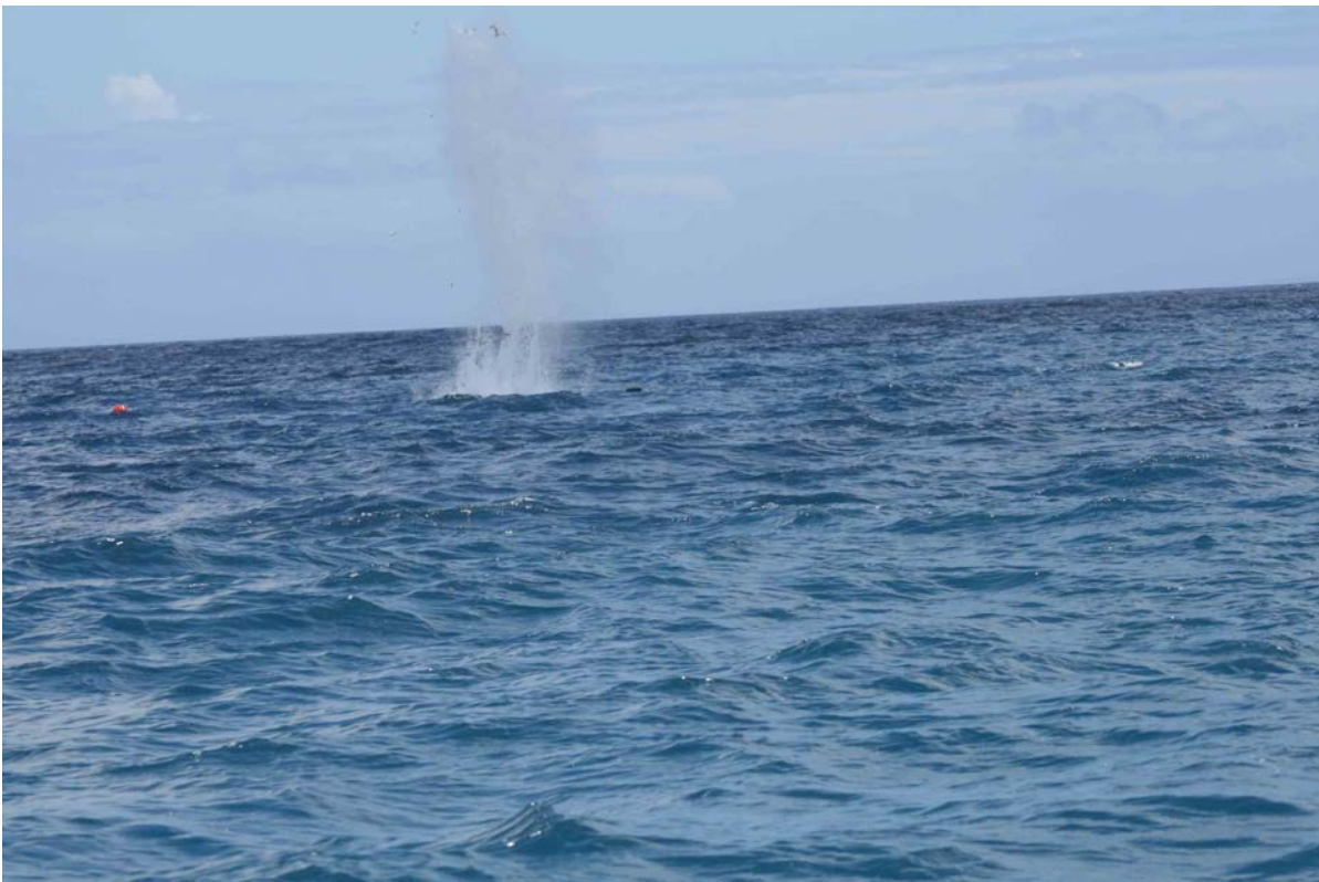
Figure 8. Detonation cord expenditure at the surface on 11 August 2011: 1.0 lb NEW