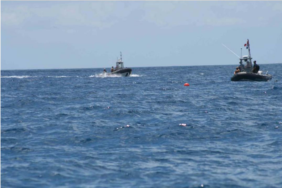
Figure 3. MDSU-1 divers preparing for the UNDET. Divers from the crew of the RHIB place charges at the obstruction marked by the orange buoy. The far RHIB is conducting the pre-exercise survey around the UNDET site, opposite the marine species monitoring vessel from which the photograph was taken.