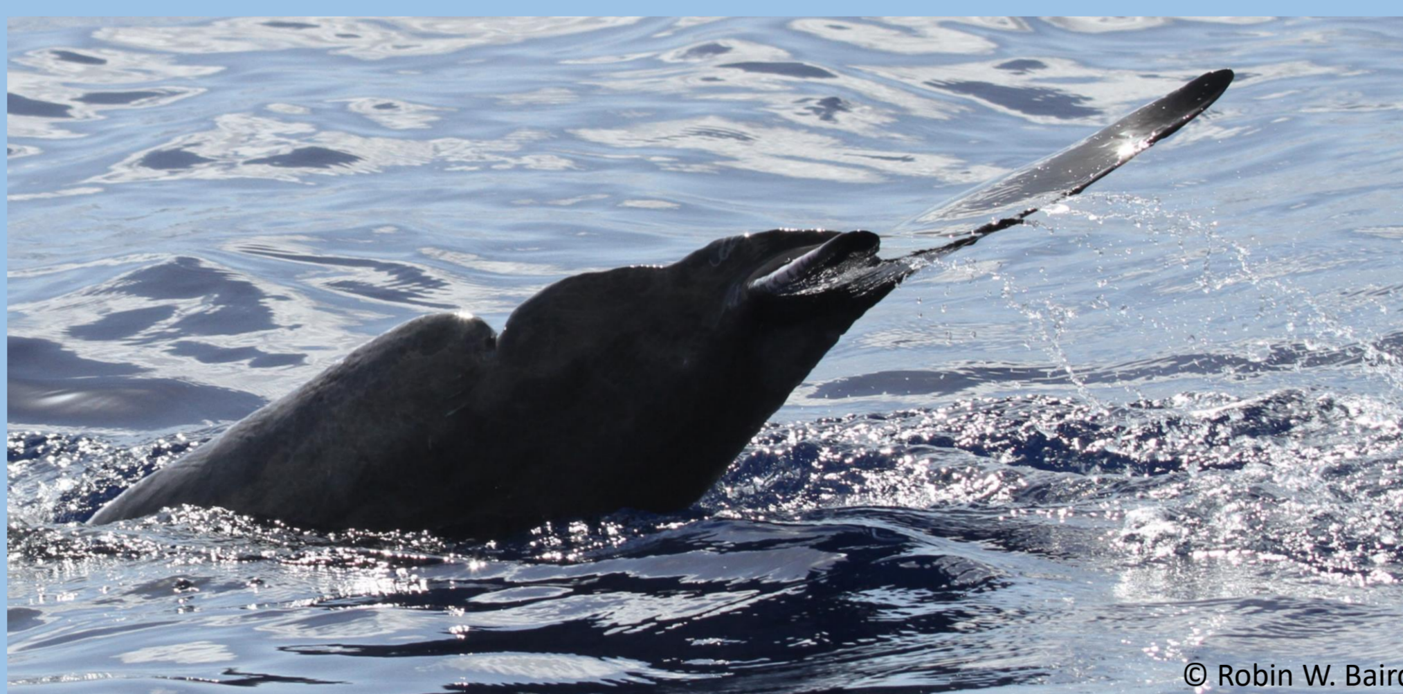
Figure 4. Dolphin with injuries consistent with a line wrap around the peduncle

Noted markings on the head, dorsal fin leading edge, and peduncle (Figure 4), where injuries can occur when hooked dolphins struggle against gear, as has been documented for false killer whales 2,3