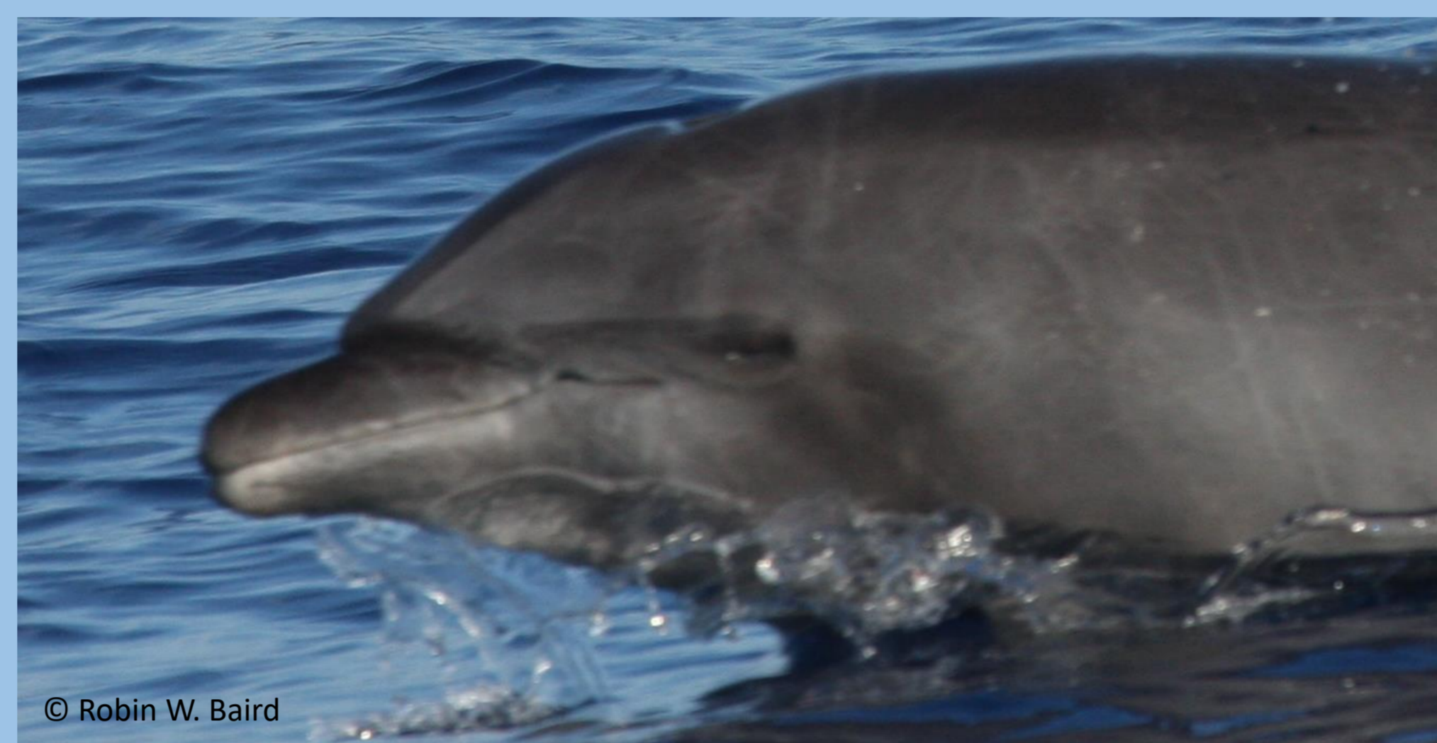
Figure 3. Individual with mouthline notch and scarring consistent with a fishery interaction

Examined mouthline photographs of 592 known individuals from bottlenose dolphin catalog spanning 1987-2018