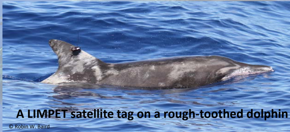
A LIMPET satellite tag on a rough-toothed dolphin