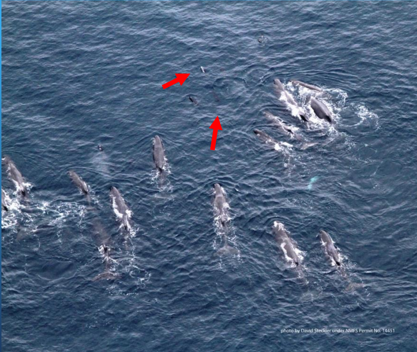
under NMFS Permit No. 14451