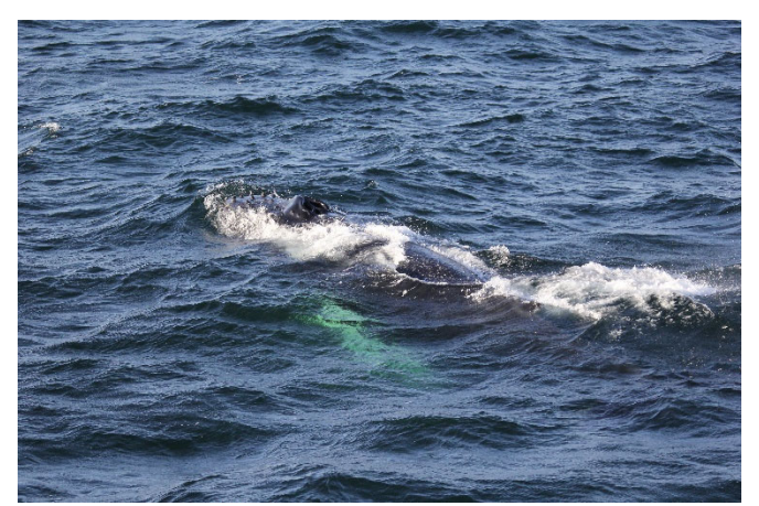
Humpback whale

Marine Physical Laboratory Scripps Institution of Oceanography University of California San Diego La Jolla, CA 92037