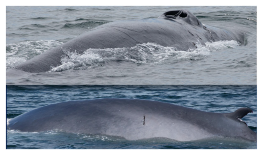
Figure 3: The muscular blowhole area, typical of both blue and fin whales, and rounded (in transverse plane) upper rostrum of the hybrid, typical of fin whales (top); and the moderate to dark gray dorsal coloration with slight evidence of a chevron, also characteristic of fin whales (bottom). Note the Pennella parasitic copepods on the back and sides. Gulf of California, Mexico, March 2020.