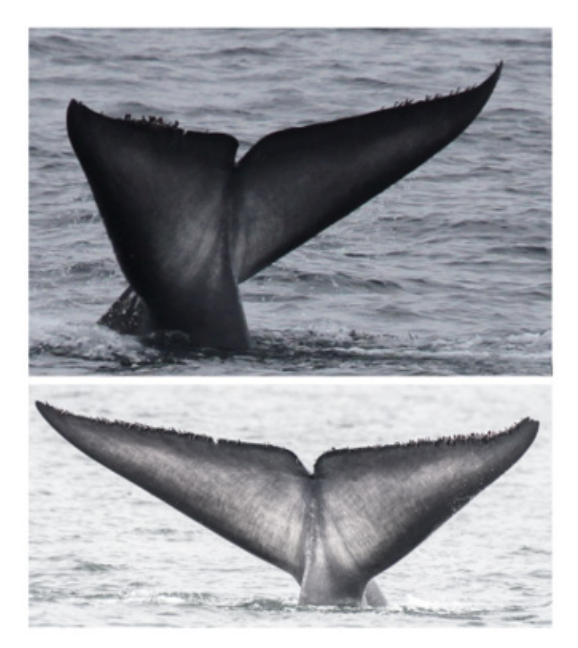
Figure 4: The appearance of the flukes of the hybrid, showing the streaked pattern lacking the distinct dark margin usually found in fin whales: September 2016 off southern California (top); July 2020 off southern California (bottom). Note the Xenobalanus barnacles on the flukes.

of the dives. Twice it logged on the surface. Several times, it swam counterclockwise around the vessel. At other times it surfaced in a manner that allowed for a good view of the right side of the rostrum through the water surface. No indication of the asymmetrical white lower jaw diagnostic to fin whales [14] was seen by observers on several different decks of the Searcher . The observers agreed that the whale was likely a hybrid. Three fin whales and two blue whales were seen shortly after this time, providing a nearly concurrent observation with which to compare the animals, and white lower right jaws were clearly visible on the fin whales.