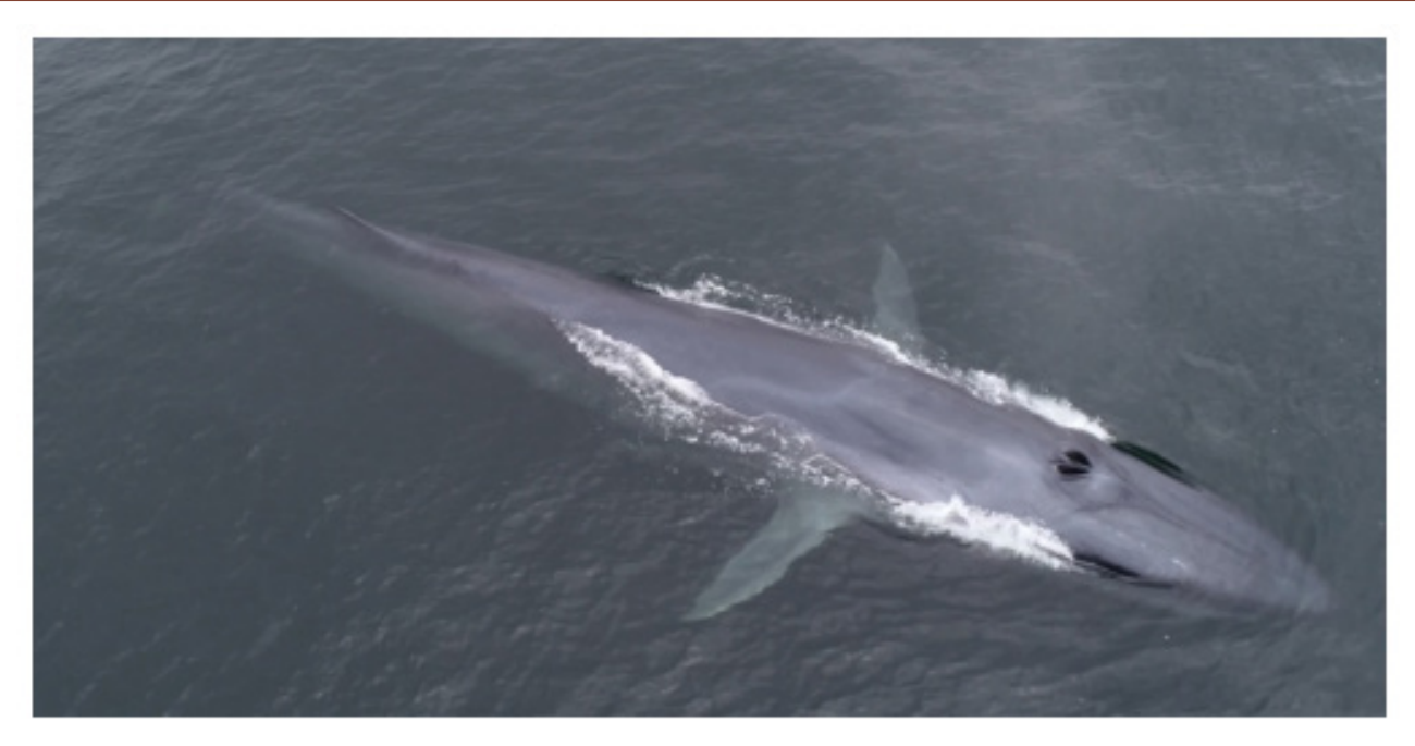
Figure 5: Drone image of the hybrid, showing the rostrum shape intermediate between a blue and a fin whale, dark right lower jaw, and the light chevron pattern on the back, Southern California, July 2020.