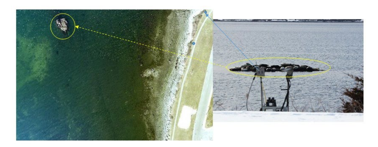
Figure 2-1. Camera set up at Naval Station Newport and Harbor Seal Haul Out