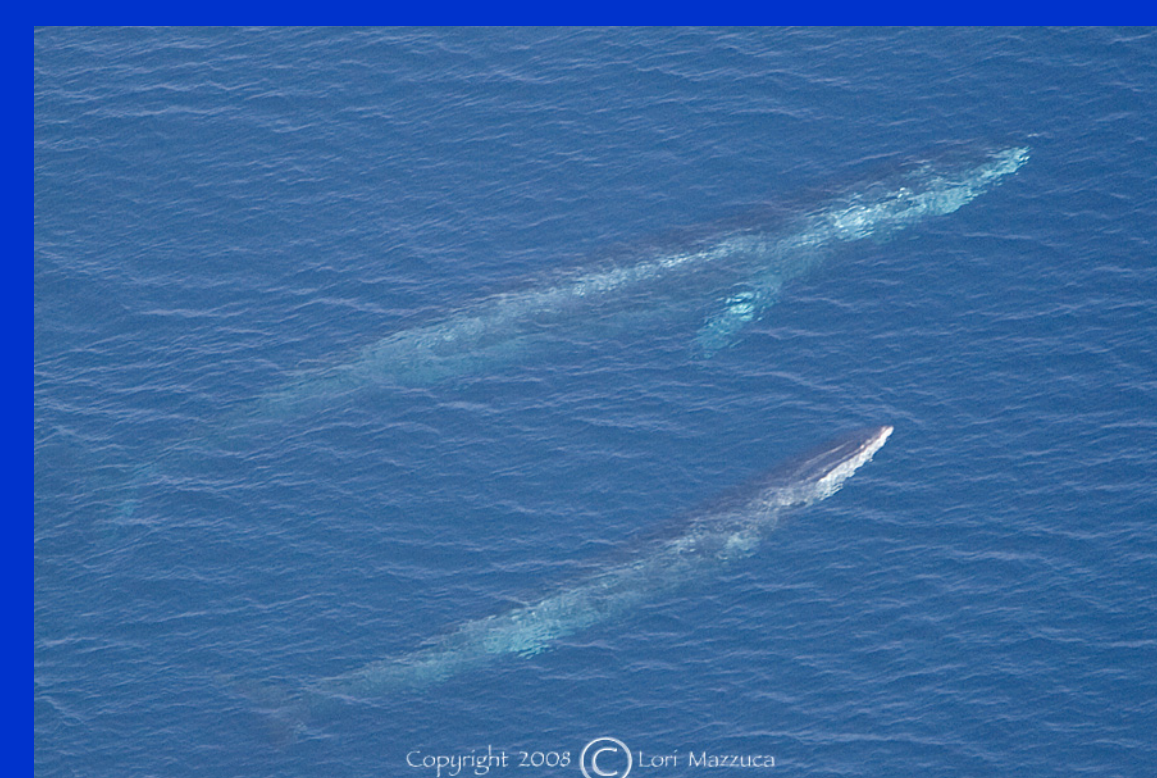
Cow-calf fin whales