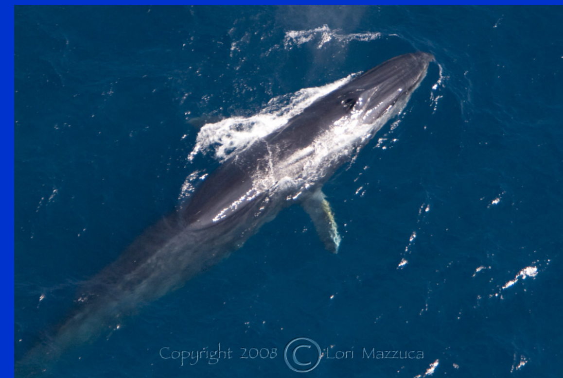
Rare sighting of Bryde's whale identified by diagnostic 3 median rostral ridges