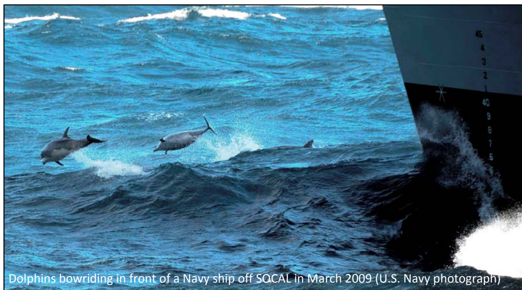
Dolphins bowriding in front of a Navy ship off SOCAL in March 2009

The Navy continues conducting robust and realistic exercises, while at the same time developing long-term range complex marine mammal monitoring plans. The goal of these plans is to integrate multiple tools in an effort to generate better assessments of marine mammal occurrence and possible MFAS effects (or lack thereof). Data collection needs to address unresolved questions regarding likely area-specific species composition and the potential for alternative detection technologies. This may be incorporated into future exercises as the Navy's exercises and marine mammal monitoring programs evolve.