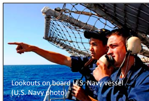
Lookouts on board U.S. Navy vessel