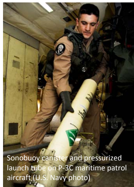
Sonobuoy canister and pressurized launch tube on P-3C maritime patrol aircraft

The annual summary of use within the HRC for Improved Extended Echo-Ranging System (IEER) sonobuoys is deemed classified. Date requested from the Navy is contained in the classified appendix to this report. Reporting elements will include (i) Total number of IEER events; (ii) Total expended/detonated rounds (buoys); and (iii) Total number of self-scuttled IEER rounds (buoys).