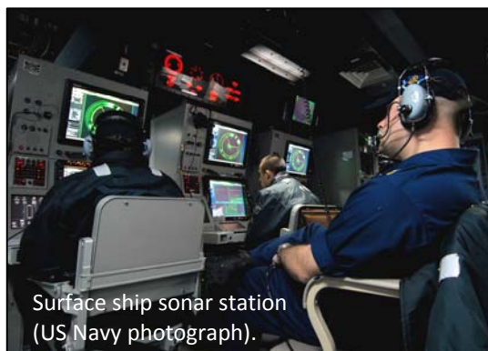
Surface ship sonar station (US Navy photograph).

The annual quantity in hours and breakdown by system of hull-mounted sonar use in the SOCAL Range Complex during non-major training events is presented in the classified appendix. The majority of this MFAS occurred during short-duration unit-level training (ULT). ULT is typically a single ship event that normally only lasts for several hours at a time.