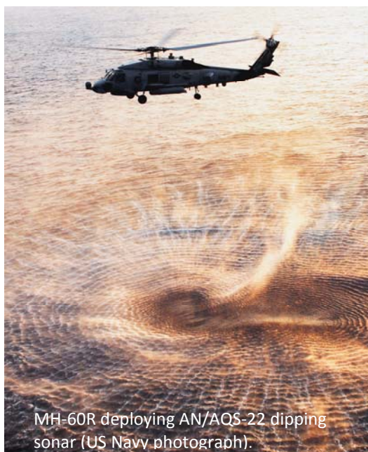
MH-60R deploying AN/AQS-22 dipping sonar (US Navy photograph).