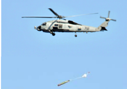
Recoverable, Mk-46 exercise torpedoes being launched from a U.S. Navy destroyer (DDG) (top left), dropped from a SH-60B helicopter (bottom left), and small boat recovery (below)