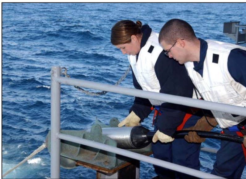
NIXIE torpedo countermeasure source (tow body) being deployed from the back of a U.S. Navy ship.

The Torpedo Countermeasures Transmitting Set, called the AN/SLQ-25A NIXIE, is a passive, electro-acoustic decoy system used to provide deceptive countermeasures against acoustic homing torpedoes. The AN/SLQ-25A employs an underwater acoustic projector housed in a streamlined body which is towed astern on a combination tow/signal-transfer coaxial cable ( Figure 2 ). An onboard generated signal is used by the towed body to produce an acoustic signal to decoy the hostile torpedo away from the ship. Electronic or electromechanical means are used to produce the required signals. The system provides an alternate target diversion for an enemy acoustic homing torpedo by stringing on cable a "noise maker", aft of the ship, which has the capability of producing a greater noise than the ship; thereby diverting the incoming torpedo from the ship to the "fish". The towed device receives the torpedoes ping frequency, amplifies it and sends it back to lure the torpedo away from the ship. It should be noted that the NIXIE is not a continuous noise source and is only activated on detecting an approaching active or passive torpedo, or for training purposes a torpedo training device such as the MK39 Expendable Mobile Anti-submarine warfare Training Target (EMATT).