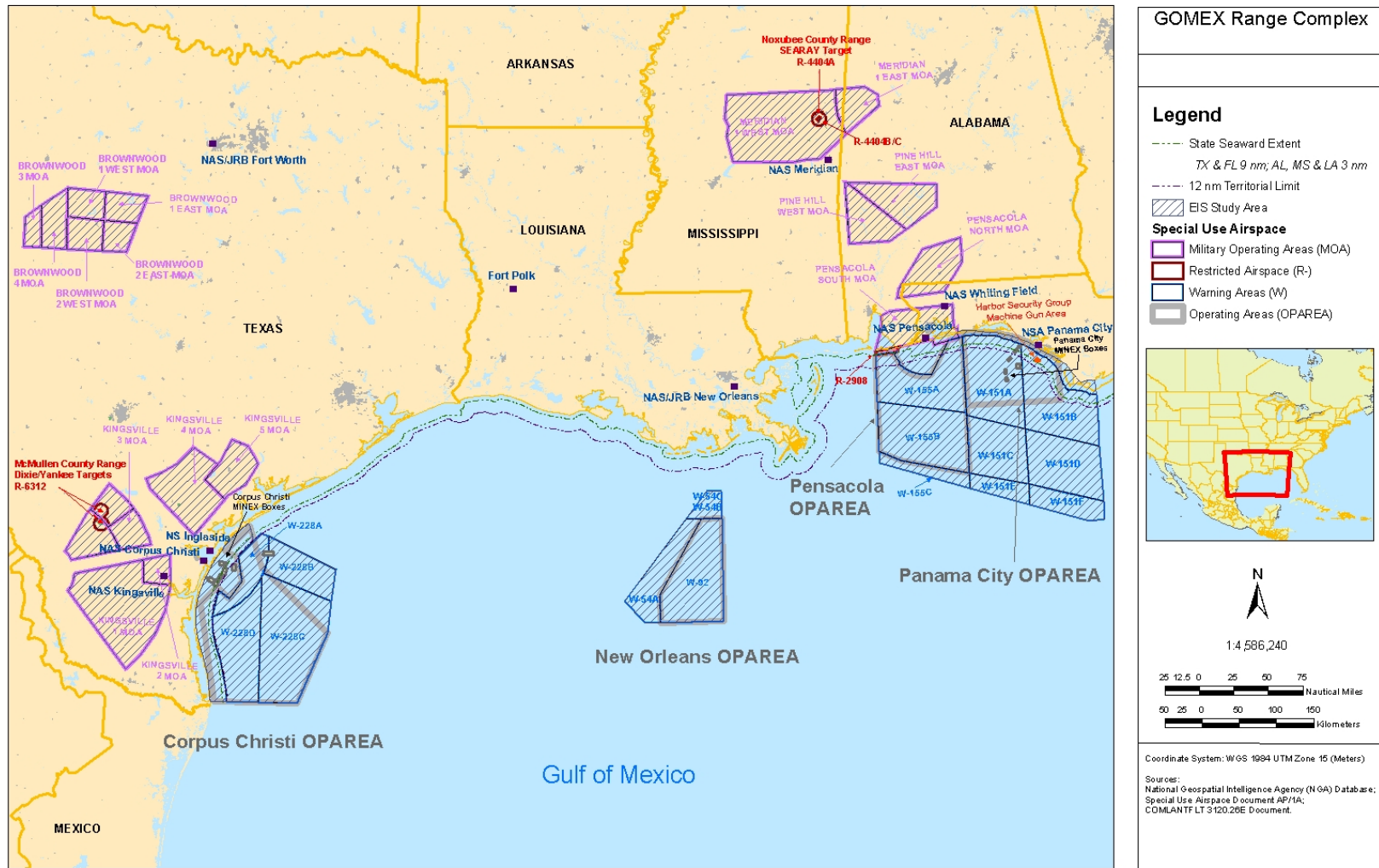
(U) Figure 3. Geographic extent of the GOMEX Range Complex.